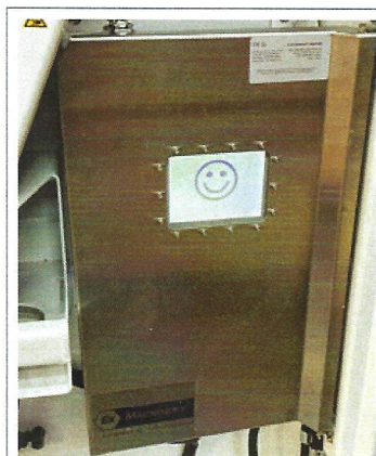
Easy operation with Smiley interface, safely locked behind impact proof door.